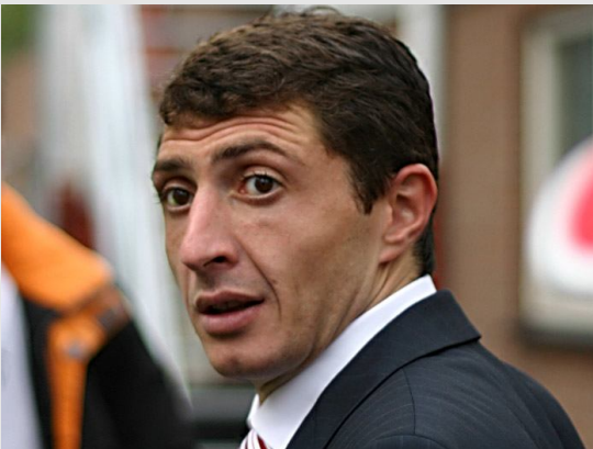
Pakhtakor Coach – Arveladze

"We played well in the first half and created many dangerous moments, but could not score. In the second half we played faster and more accurately. As a result, we accomplished the plan."