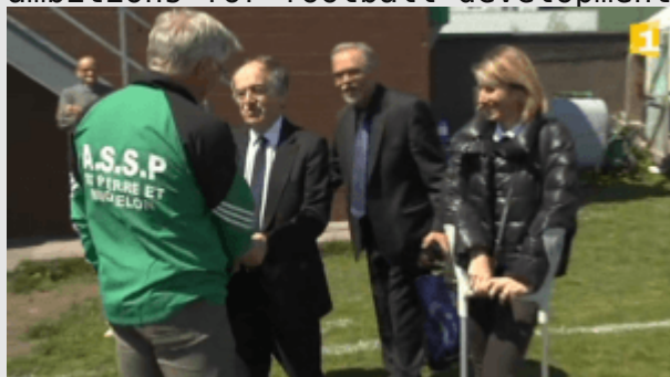
Noël Le Graët Visits

2015, give hope of federation support, unsure if any will materialise. Speaking at the 2012 Coupe de l'Outre-Mer, midfielder Stanislas Beck spoke of the ambitions for football development on the islands.