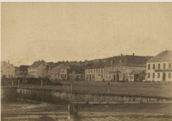
St.Pierre in 1887

This period would last until 1933 with the U.S. repeal of prohibition, though the islands would not be spared from drama with the outbreak of WWII, with St.Pierre & Miquelon serving as a North American front for events in Europe. Following the German invasion of France, the islands came under control of the German allied axis Vichy Regime. However supporter of De Gaulle's Free France movement staged a successful and peaceful coup on Christmas Eve 1941, being an initial success for the allied forces. Tragedy would also strike when the Free France corvette "Mimosa" carrying mostly men from St.Pierre sank escorting allied convoys on 9th June 1942 with 65 losses.