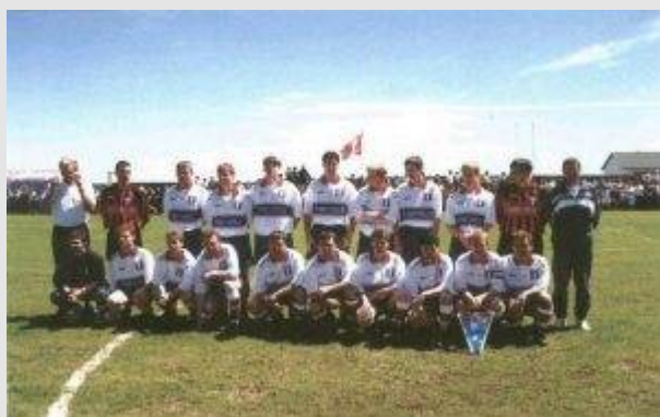
St.Pierre&Miquelon v VCF