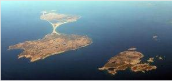
Smaller St.Pierre & larger Miquelon

better arable land. Waters around the islands remained treacherous, earning the islands the moniker of "Cemetery of Shipwrecks". A local legend suggests that the 12km isthmus which connects the larger islands of Miquelon and Langlade was created from deposits collecting around past shipwrecks between the islands.