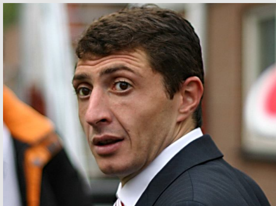
Pakhtakor Coach – Arveladze